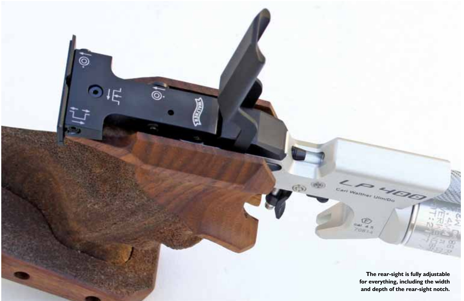
The rear-sight is fully adjustable for everything, including the width and depth of the rear-sight notch.

The ISSF Air Pistol match is a gruelling one, requiring 60 scoring shots plus sighters to be fired in the Open section of the match. The 10-ring is only 10mm in diameter, so it is time-consuming to execute that many precision shots where the shooting arm needs to be held up for an average of 10 seconds per shot. On the other hand, if the pistol is too light, it is likely to be less stable and more easily affected by small movements associated with the shooter's physiology and the functioning of the pistol's mechanism. The Walther LP400 Carbon has addressed these issues in its design of the LP400's dynamics and operation. The Vario trigger system, for example, is ball bearing mounted and attached as close to the barrel axis as possible, so that torque on the pistol that exerts downward pressure at the muzzle is minimised when pressure is applied to the trigger. The trigger is naturally fully adjustable