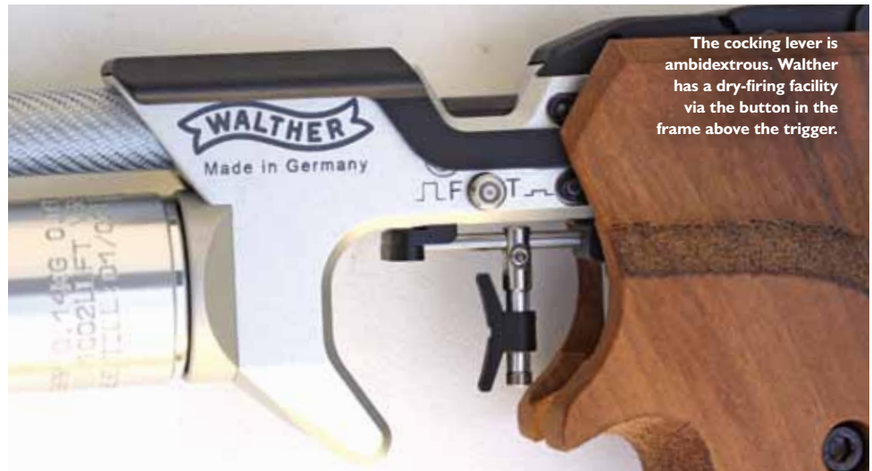
The cocking lever is ambidextrous. Walther has a dry-firing facility via the button in the frame above the trigger.

allow a pellet to be dropped in the ramp without the fingers fouling the frame. Another internal development on the air pistol is a low-impulse striker valve, which is again designed to minimise any motion of the pistol on discharge.