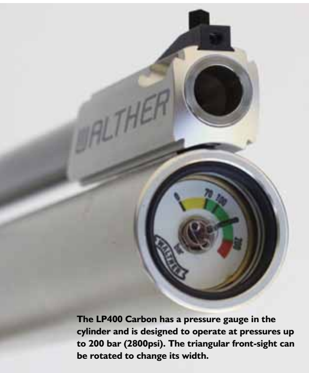
The LP400 Carbon has a pressure gauge in the cylinder and is designed to operate at pressures up to 200 bar (2800psi). The triangular front-sight can be rotated to change its width.

The LP400 Carbon has a large double-sided loading lever that is lifted 90 degrees to open the 'bolt' and expose the loading ramp, as well as set the trigger system. This makes loading easy, as the loading ramp area has cut-outs on either side that