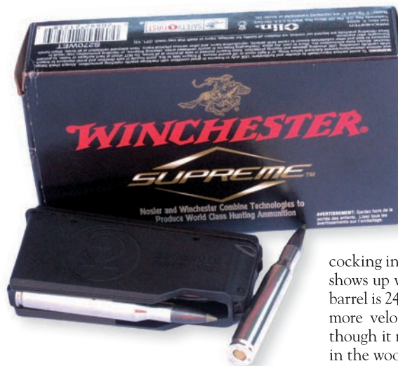
LEFT: Polymer magazine of TC Venture holds 3 rounds of ammo and is a smooth operator.

click when released which may alarm an animal in the woods. If you move it slowly that will mitigate most of the noise. The Venture bolt has a prominent cocking indicator on the back of the bolt that shows up well when the rifle is cocked. The barrel is 24" long which will give the .270 a bit more velocity than the more common 22", though it might be a little more cumbersome in the woods.