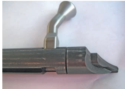
BELOW LEFT: TC Venture bolt has a pronounced cocking indicator.