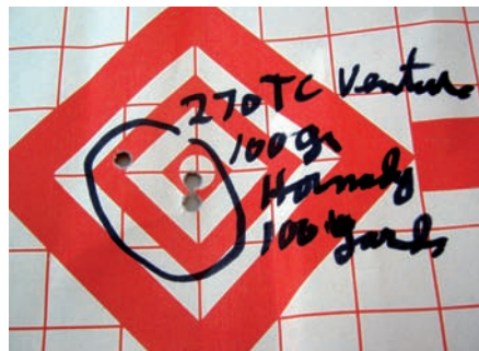
The 100 grain Hornady proved to be an accurate varmint load.

We took the Venture to the local public range in order to wring it out. The ammo was a handload which is 60 gn of IMR 7828 and a 130 grain Remington soft point. After getting it on the paper, the Venture displayed excellent accuracy. The largest group was barely over an inch and that was due to a left to right breeze at 10 mph or so. The rest of the groups averaged less than an inch with a couple much less. That would indicate that this rifle will indeed shoot an inch group as per TC's advertisement. We tried some 100 and 150 grain Sierras for groups and they both stayed around an inch or less though they had different points of impact. The 150 grain Sierras were possible the most accurate bullet tested though not by much. For info on Sierra products go to http://www.sierrabullets.com for a list of its products. I shot a few 130 grain Barnes TTSX bullets and they also shot well and would be a top choice for western mule deer here in the US.