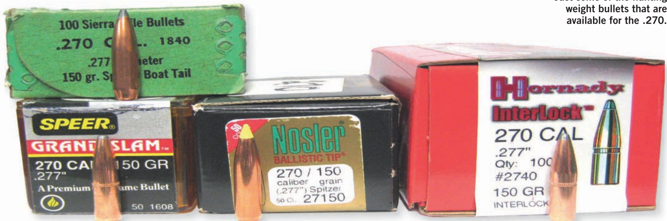
Just some of the hunting weight bullets that are available for the .270.

Anyone who makes rifles or ammo offers the .270 Winchester round. Bullet weights are available from 90 to 180 grains