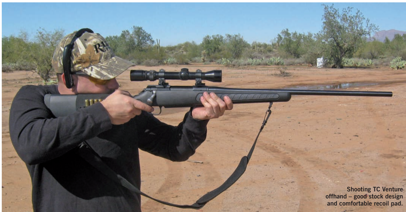
Shooting TC Venture offhand – good stock design and comfortable recoil pad.

Quality low cost hunting rifles are being offered by several companies. The competition is fierce so anyone entering the market has to have a quality product or they won't last. Our US correspondent gives us an advanced look at the new economy bolt action from Thompson Centre.