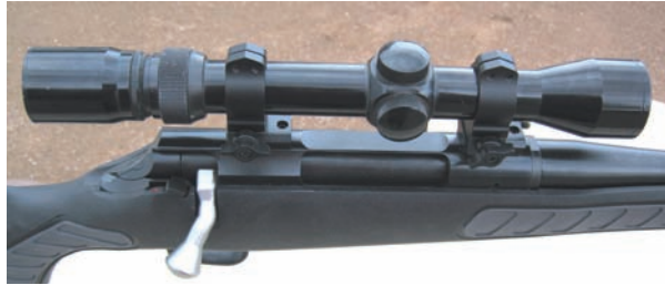
LEFT: The Venture action – Scope bases are standard.