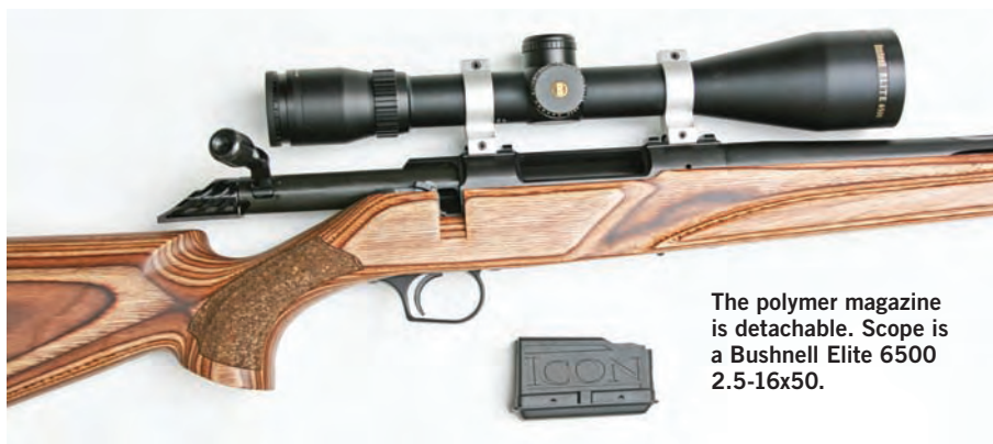
The polymer magazine is detachable. Scope is a Bushnell Elite 6500 2.5-16x50.