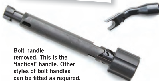
Bolt handle removed. This is the 'tactical' handle. Other styles of bolt handles can be fitted as required.