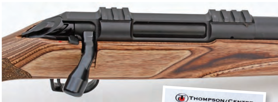
ABOVE: The Icon action has integrated Picatinny/Weaver scope mounting rails that allows plenty of latitude for ring spacing with any Weaver-type mounts. The Icon has a double safety system. The main lever locks the trigger while allowing the bolt to be operated. The smaller lever locks the bolt closed.

The Icons come with a 3-shot polymer box magazine that is released with a catch at the front of the magazine. A very good accessory supplied with the Precision Hunter is one of those 'why has than not been thought of before...' items – a single shot adapter that clips into the top of the magazine. This red plastic insert takes a couple of seconds to insert and remove and works very well when single-loading the rifle.