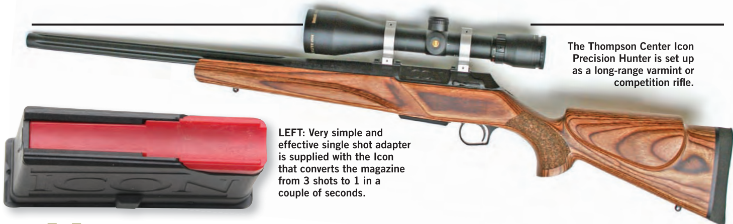
The Thompson Center Icon Precision Hunter is set up as a long-range varmint or competition rifle.