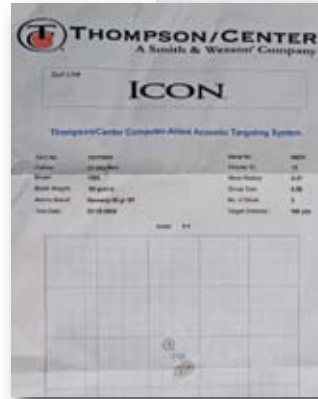
(Left) Electronic 3-shot target supplied with the rifle from the factory - 0.58" indicates the rifle's potential.

surprises me that manufacturers who choose to use a box magazine don't employ their design. Not only does it produce perfect feed, but you have five and six round capacity in the magazine. Besides, it is all metal – which in my opinion is desirable.