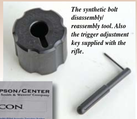
The synthetic bolt disassembly/reassembly tool. Also the trigger adjustment key supplied with the rifle.

The three-round detachable magazine, in my mind is not one of the rifle's strongest points – I don't like plastic in firearms, but this is a modern high tech gun so I guess we have to make concessions for that. The three round capacity couldn't be seen as an advantage. Sako perfected the detachable box magazine more than a decade ago, and it