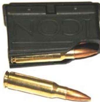
The Icon magazine holds three rounds. Note that the factory loads only just fit for overall length, so handloaders seating bullets out further will have a problem.