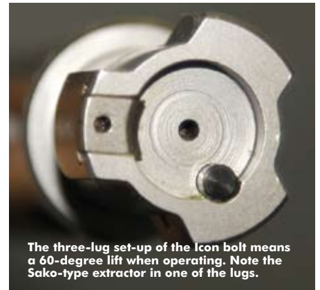
The three-lug set-up of the Icon bolt means a 60-degree lift when operating. Note the Sako-type extractor in one of the lugs.