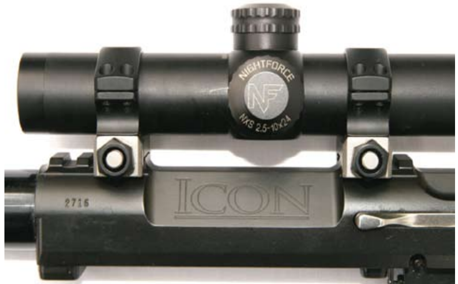
The Nightforce NXS 2.5-10x24 scope was very securely held in place with these massive Nightforce mounts. It's not often that one fits a mount using a spanner.

Shooting over the sandbags really highlighted the crisp trigger, which