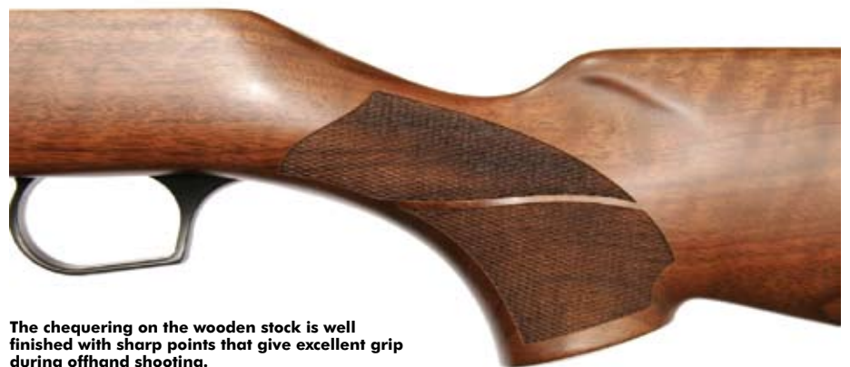
The chequering on the wooden stock is well finished with sharp points that give excellent grip during offhand shooting.