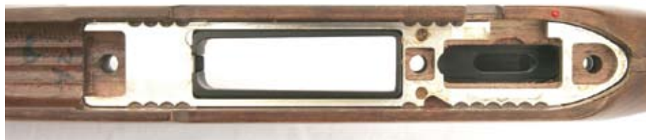
The aluminium plate is embedded into the wooden stock and assists excellent bedding between plate stock and action.