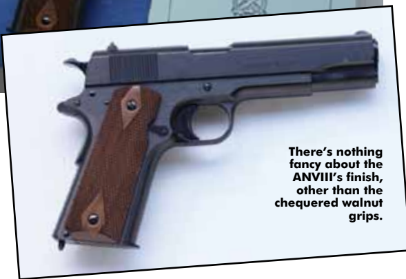
There's nothing fancy about the ANVIII's finish, other than the chequered walnut grips.

The ANVIII comes in special packaging, albeit a cardboard box, with the gold Colt logo on the lid. Included is an information sheet with a synopsis of the history of the 1911, and of most interest to collectors is a reproduction of an original Colt Government Model US Army manual on the pistol. Also included in the outfit are a lock, a take-down tool, a plastic chamber indicator and a conventional Colt 1911 instruction manual. Two magazines come with the