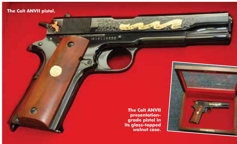
The Colt ANVII pistol.