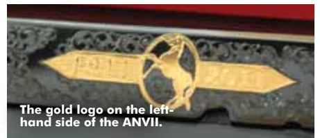
The gold logo on the left-hand side of the ANVII.