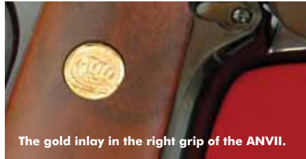
The gold inlay in the right grip of the ANVII.

For more information on pricing and availability on these commemorative Colt 1911 self-loading pistols, contact Frontier Arms on 08 8373 2855 or visit www.frontierarms.com.au ●