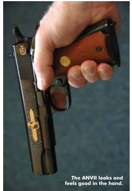
The ANVII looks and feels good in the hand.