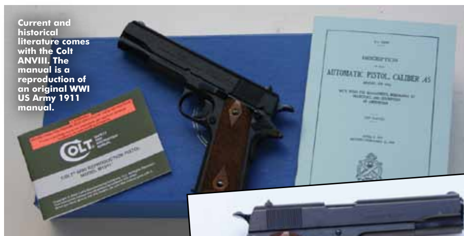
Current and historical literature comes with the Colt ANVIII. The manual is a reproduction of an original WWI US Army 1911 manual.

The interesting thing about this firearm is that it really is a bog-standard military-style 1911 single-action self-loading pistol, without any attempt to scrub it up with a higher level of polish or finish. Its main